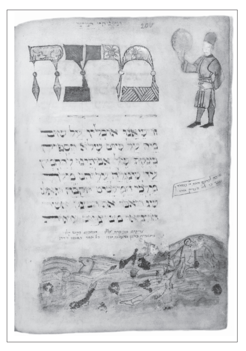
7) Yahudah Haggadah, fol. 20v: Egyptians drowning, courtesy of the Israel Museum, Jerusalem.