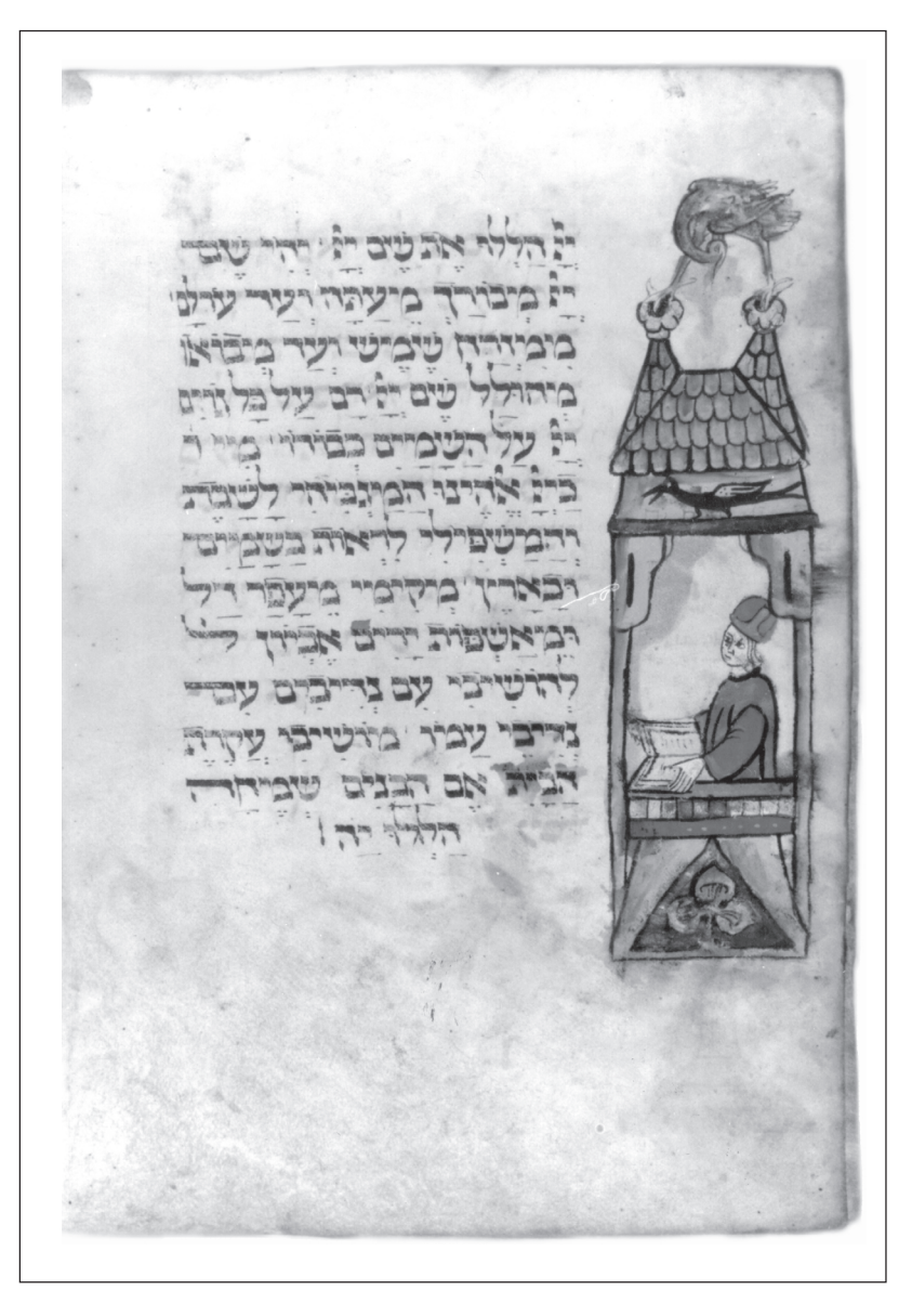
11) Second Nuremberg Haggadah, fol. 23v: Hallel , architectural frame with bird, courtesy of Schocken Library, Jerusalem.