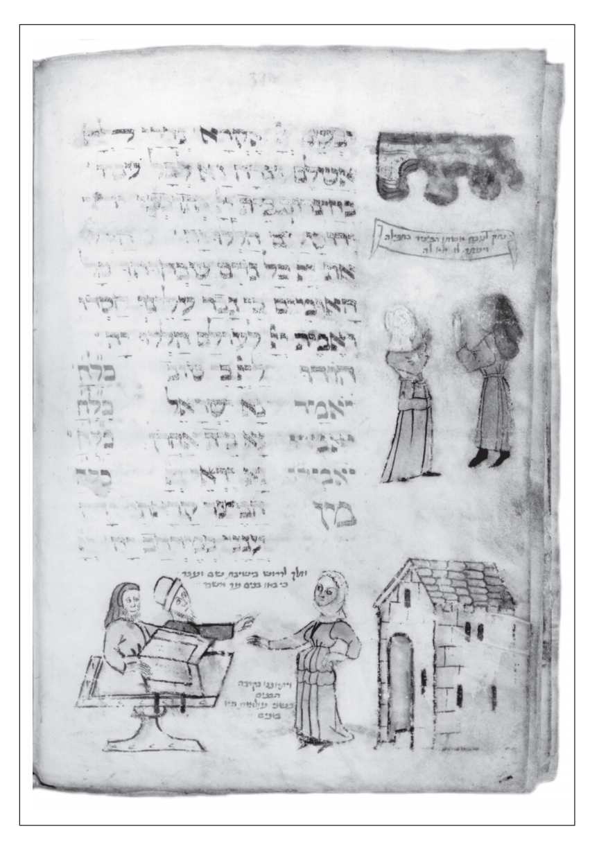
10) Yahudah Haggadah, fol. 31v: Rebeca consulting Sem and Eber, courtesy of the Israel Museum, Jerusalem.