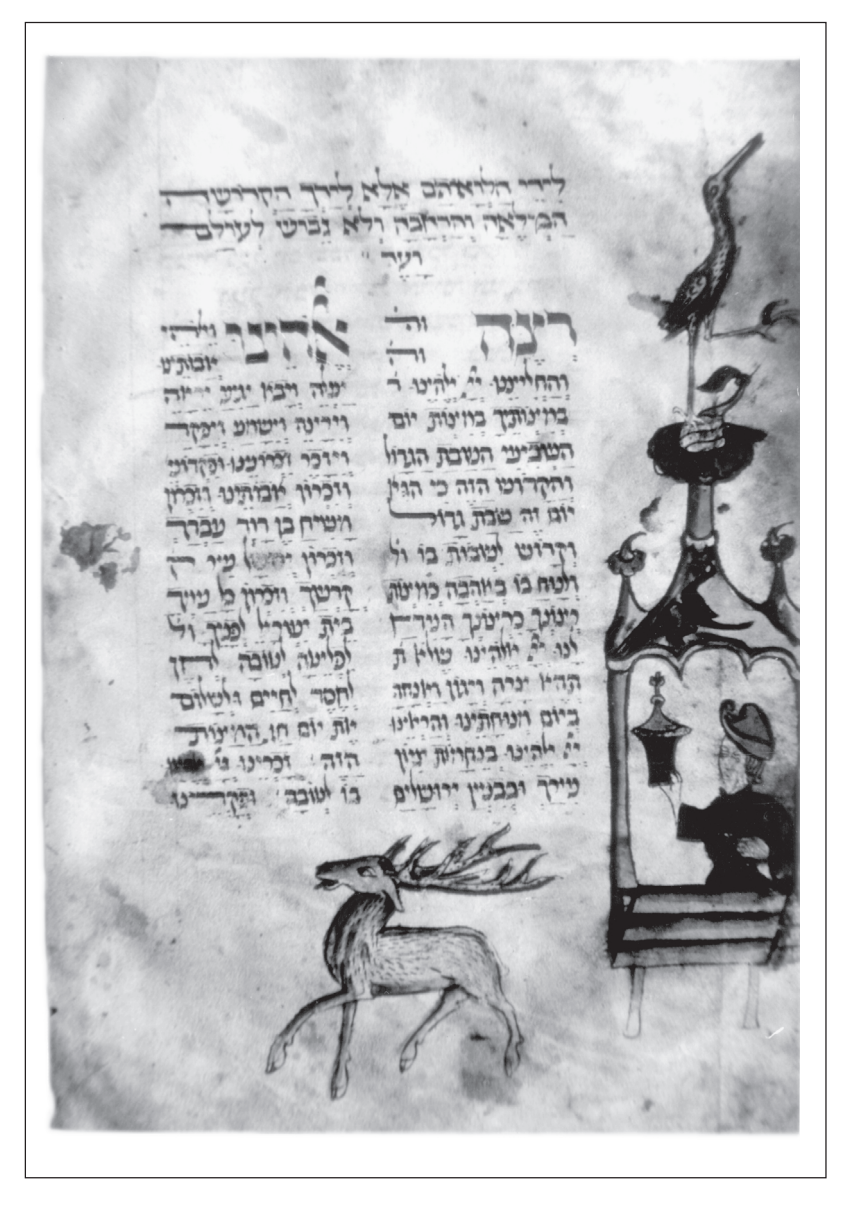
13) Second Nuremberg Haggadah, fol. 27v: Lifting of wine cup, deer, courtesy of Schocken Library, Jerusalem.