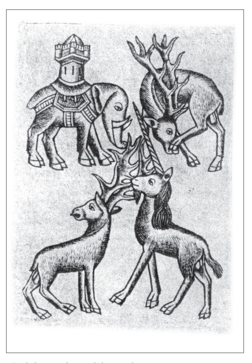
16) Elephant, set of engraved playing cards, Vienna, Österreichische Nationalbibliothek, Germany, 15th century, after Geisberg.