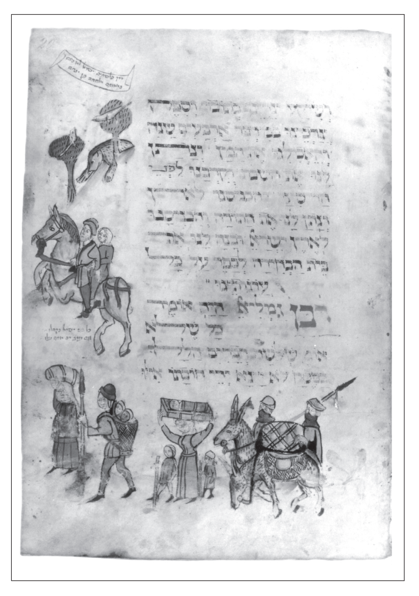
6) Second Nuremberg Haggadah, fol. 20r: departure from Egypt, courtesy of Schocken Library, Jerusalem.