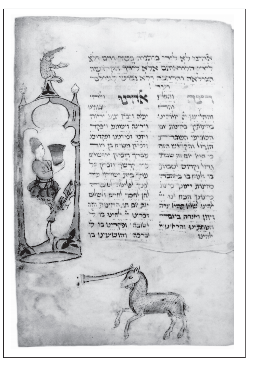
15) Yahudah Haggadah, fol. 27r: Lifting of wine cup, elephant, courtesy of the Israel Museum, Jerusalem.